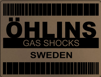
ÖHLINS RETRO BLACK