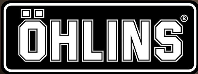
ÖHLINS BLACK/WHITE MEDIUM