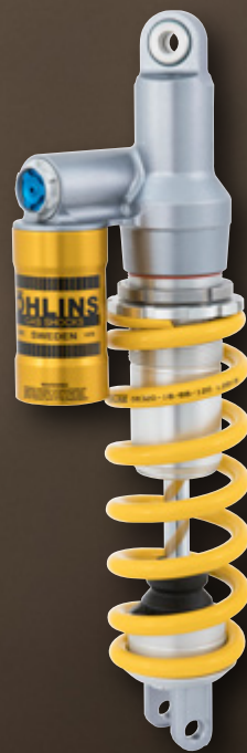
TTX FLOW WITH PDS SHOCK ABSORBER