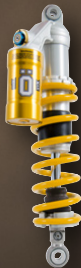
STX 46 SHOCK ABSORBER