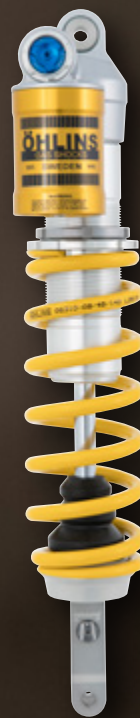
TTX FLOW SHOCK ABSORBER