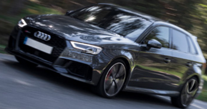
ROAD & TRACK